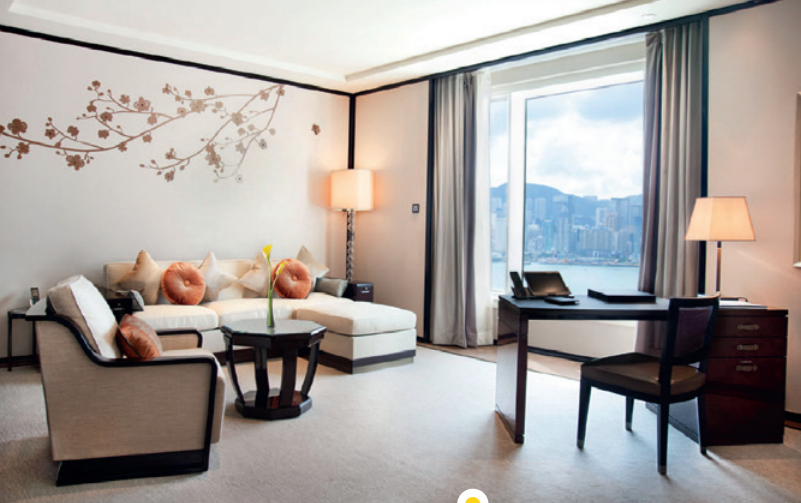
Left: A deluxe suite at the Peninsula Hong Kong.