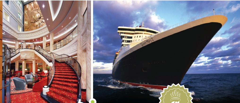
Above: Queen Mary II, your favourite large cruise ship.