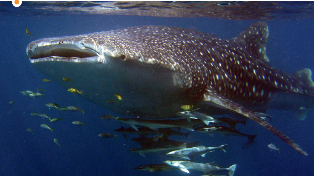
Above: Swim with whale sharks at Sal Salis Ningaloo Reef.