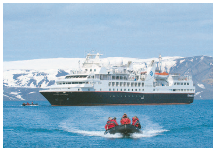
Exploring Antarctica on the Silver Explorer.

"For spiritual journeys and off-the-beaten-path adventures, Bhutan – the magical kingdom of happiness bordered by China and India – is a new destination that is coming on the radar."