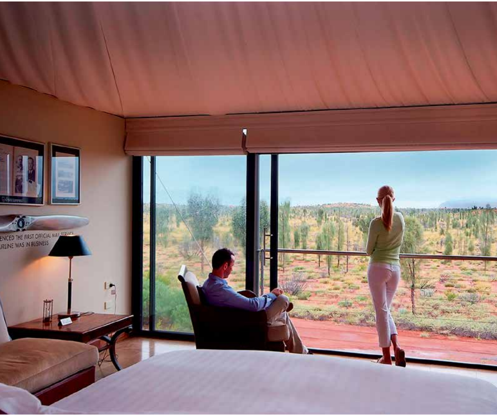
Below: Eco friendly without compromise at Longitude 131°.