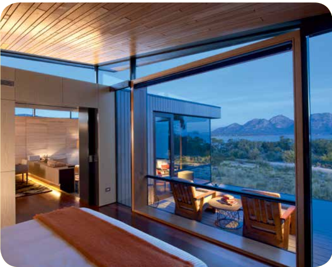
Above: Saffire looks out over The Hazards mountain range. Below: Adults-only Likuliku is made for romance.

"Arriving at this resort felt like arriving in paradise and the views are consistently amazing. There's also a great reef regeneration and sea turtle protection program"