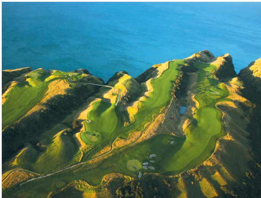
Above: Where the fairways meet the sea at Cape Kidnappers.