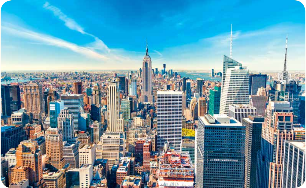
Above: If you can make it there you can make it anywhere: New York!

"The seats are incredibly spacious – even with the seat extended to a flat bed there is enough room to comfortably walk around the end from the window seat. They also serve great pisco sours!"